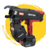
Tie Wire Guns