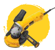
Grinders &amp; Saws