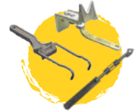
Camlocks, Turnbuckles, & Strongbacks